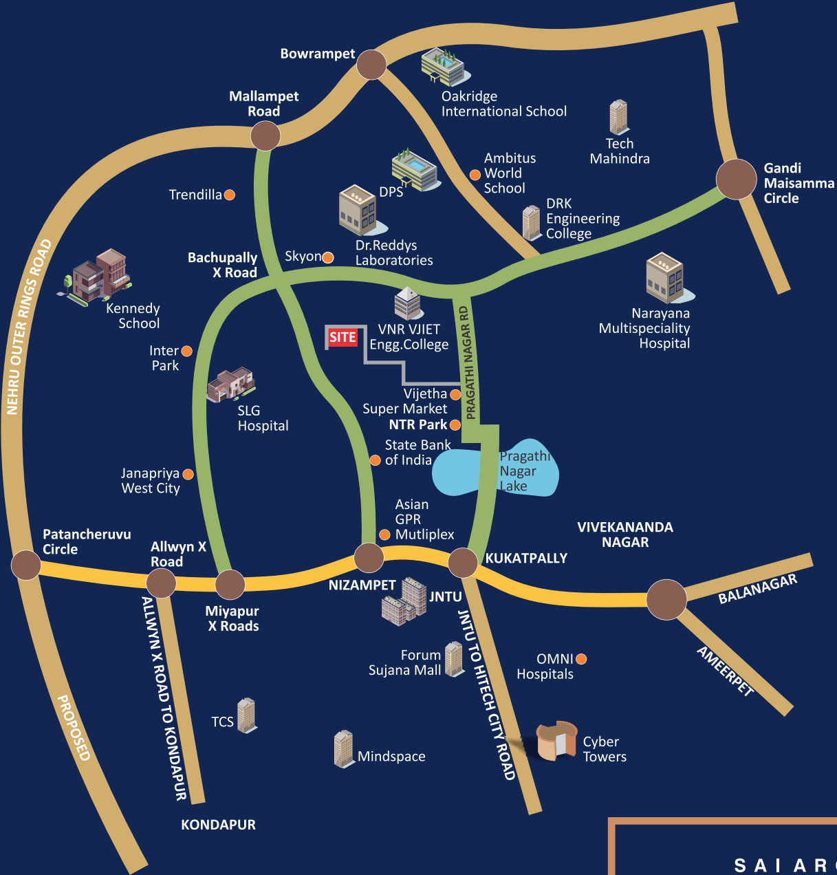
LOCATION PLAN (Not to Scale)