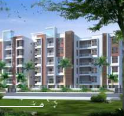
RIVER SHADES @ MANIKONDA