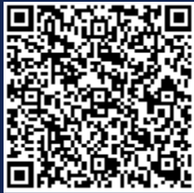
LOCATION QR CODE

Coming up in one of the most coveted locations of Hyderabad, Surya Elite has the advantage of connectivity and accessibility. The wide roads, efficient public transport and great infrastructure make the neighbourhood suitable for a grand lifestyle and the best returns on investment.