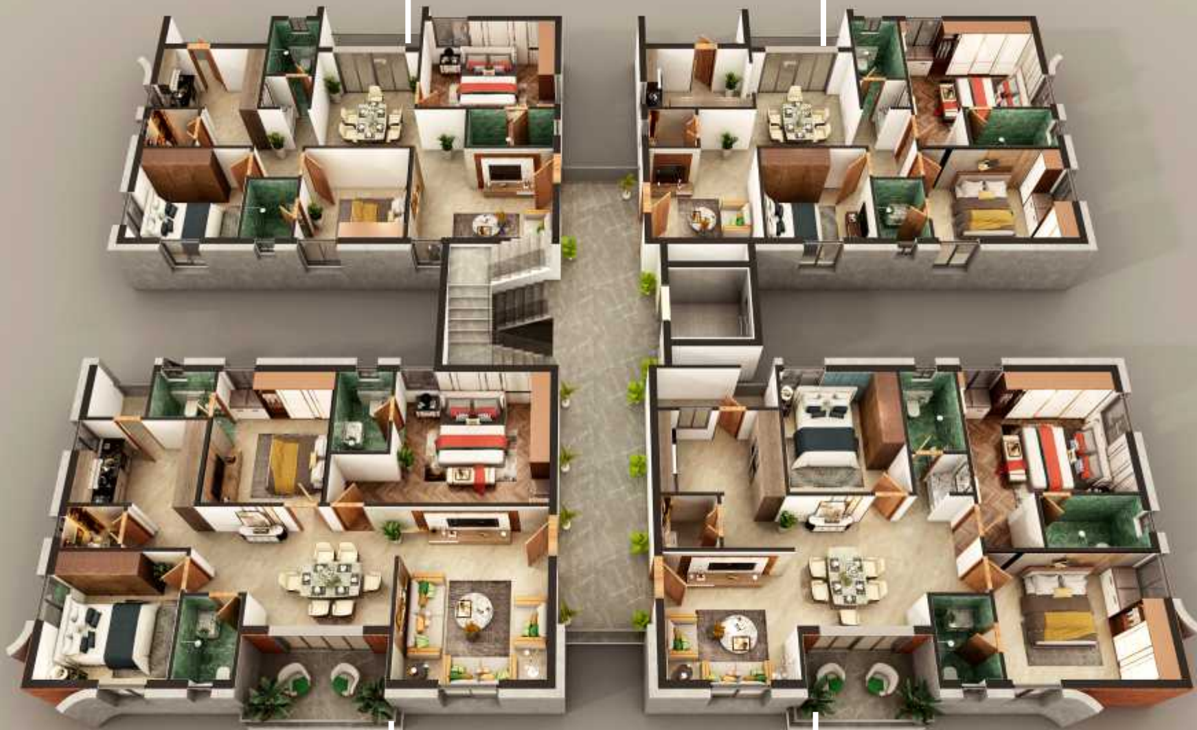
UNIT - 4 West Facing 1660 sft.