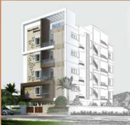
SERENE @ KAVURI HILLS