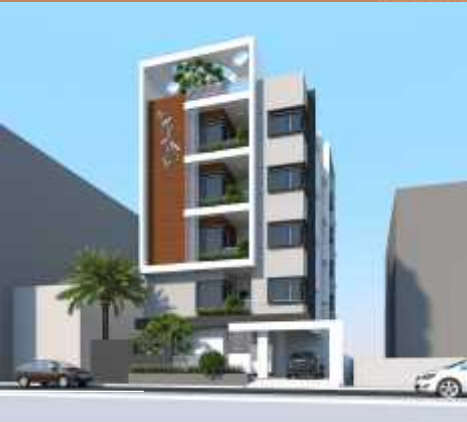
SERENE HILLS @ BHARANI LAYOUT