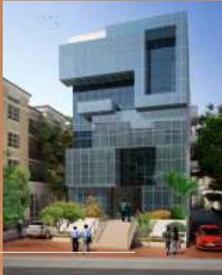
PRASHANTHI TOWERS @ BANJARA HILLS